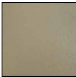
SC Beige (SB)