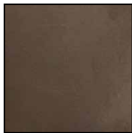
Mineral Bronze (B)

KNC's SDL-V90, SDL-FP, SDL-SG Louvers are painted using a VOC-free electrostatic painting process that causes the paint to be attracted to all exposed surface areas of the metal. This method yields a continuous coat of paint both inside and outside of the part providing excellent protection against moisture and dust, giving your product the longest lifespan possible.